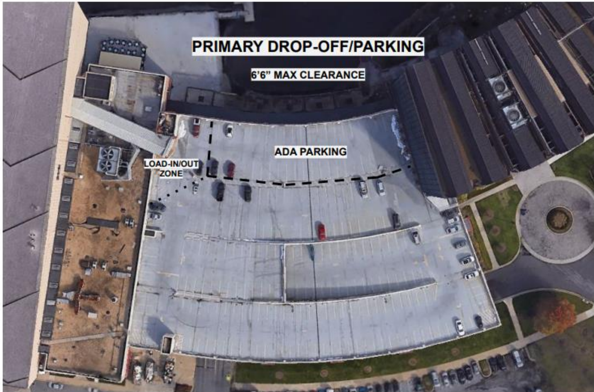
Entrance to Primary Drop-off/Parking